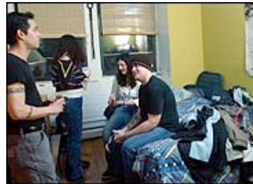
A knot of Suicidegirls.com partygoers in a bedroom in Bushwick.